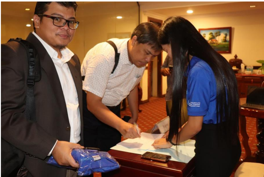
Gambar 2. Tim Erasmus+ Industry 4.0 dari USU