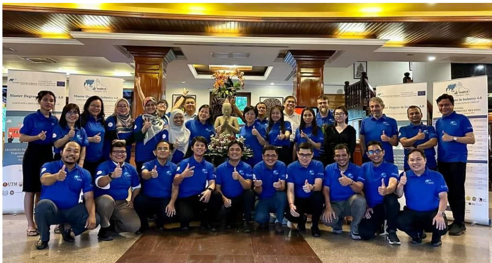
Gambar 3. Dokumentasi Aktivitas/Kegiatan Rapat Jejaring Konsorsium Erasmus+ Ind4.0