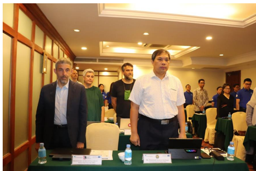
Gambar 1. Suasana Pertemuan Erasmus+ Industry 4.0